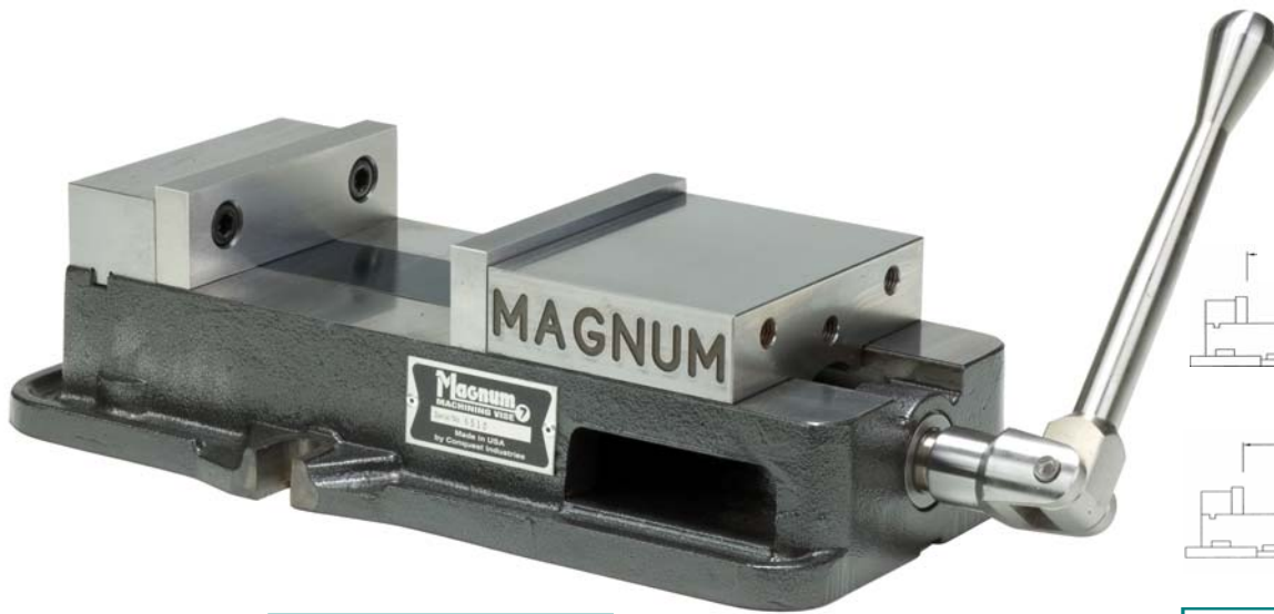
Jaw Openings (inches)