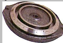
Optional Swivel Base